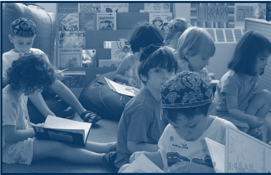
It's reading time in JK!