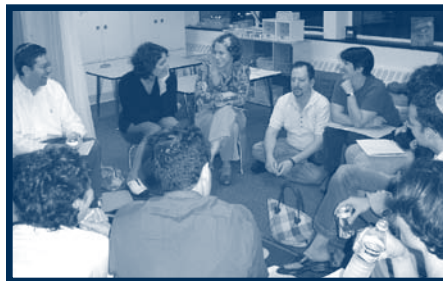
Parents at Back to School Night talking about their children's experiences at CJDS.